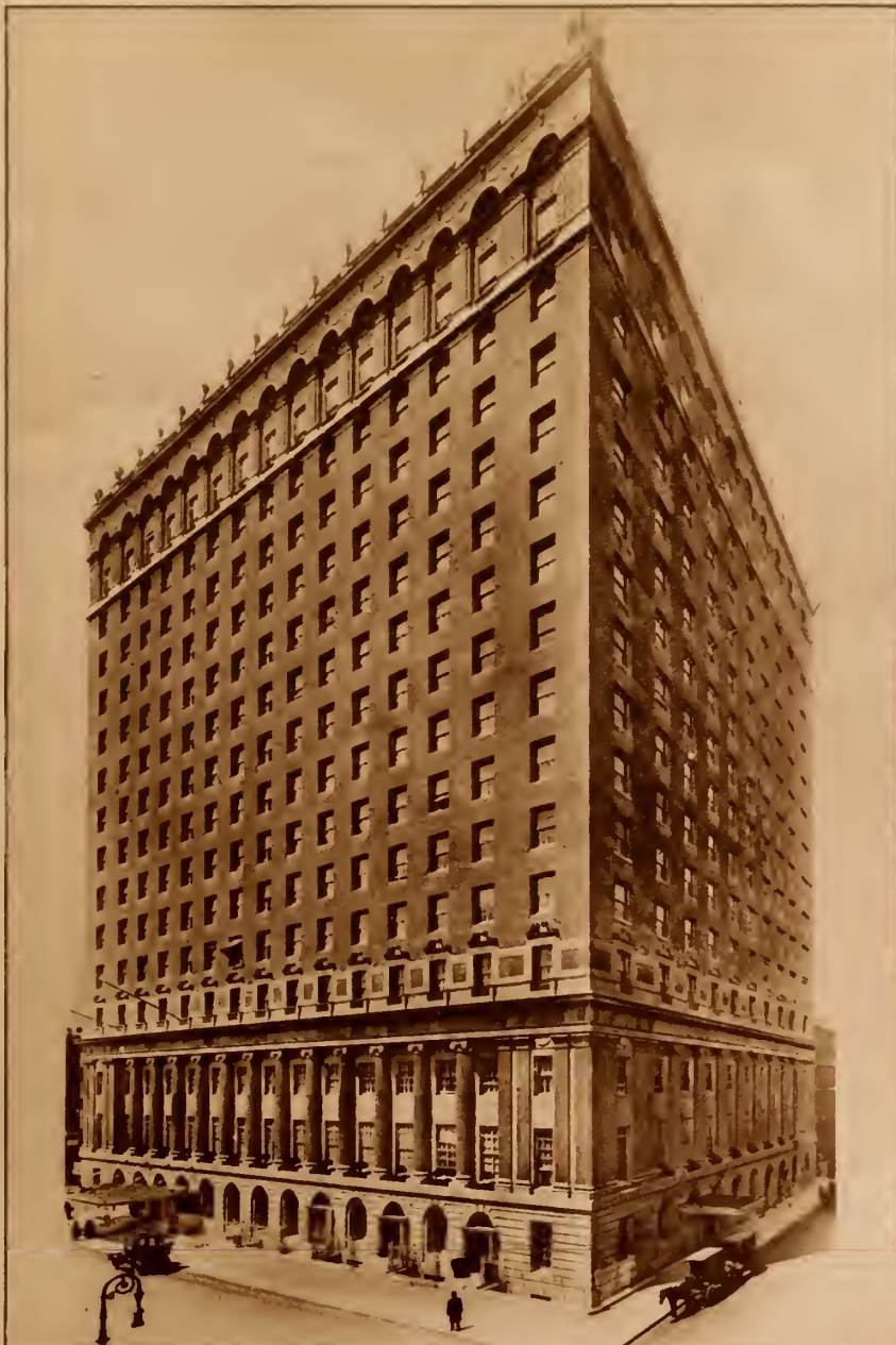
THE RITZ-CARLETON HOTEL. Meeting Place of Society in the exclusive Park Avenue District.